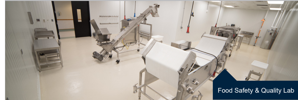
Food Safety & Quality Lab

Lakeland is constantly investing in campus classrooms and lab spaces to provide students with modern, high-quality places to learn. Thanks to the generosity of donors and corporate partners, Lakeland labs often replicate what students will find in the workplace following graduation.