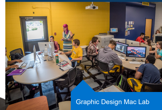
Graphic Design Mac Lab

Pre-Chiropractic Pre-Dentistry Pre-Law Pre-Medicine Pre-Ministry Pre-Optometry Pre-Pharmacy Pre-Physical Therapy Pre-Veterinary