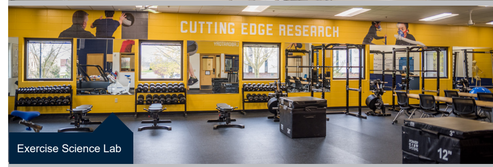
Exercise Science Lab

My classes helped prepare me for the real world because we worked on actual freelance projects for non-profit organizations. As a graphic designer, freelancing becomes a huge part of your life, and getting my feet in the water before I graduated helped me immensely.