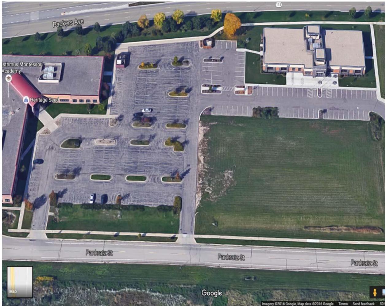
Lakeland University Madison Campus (Non-Residential) 1650 Pankratz Street