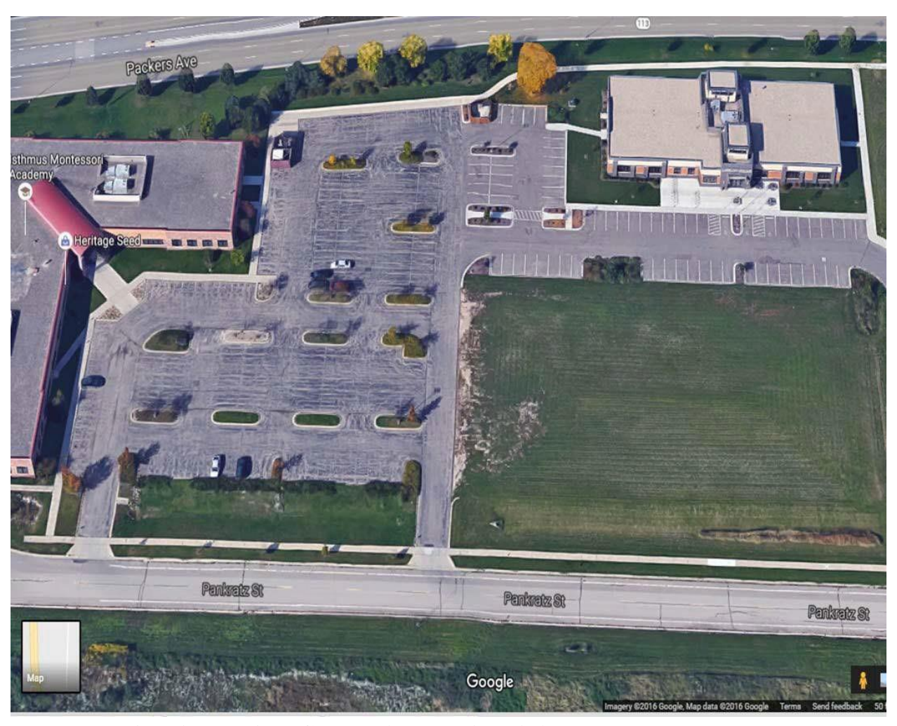
Lakeland University Madison Campus (Non-Residential) 1650 Pankratz Street, Madison, WI 53704