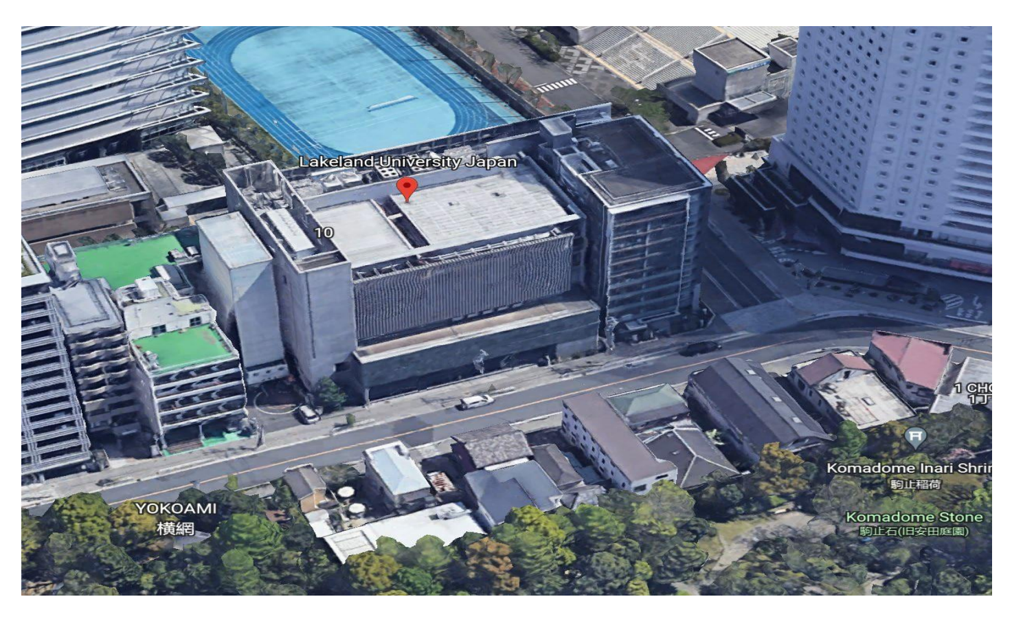
Lakeland University Tokyo, Japan Campus (Non-Residential) 1-10-5 Yokoami, Sumida-ku, Tokyo, 130-0015 Japan