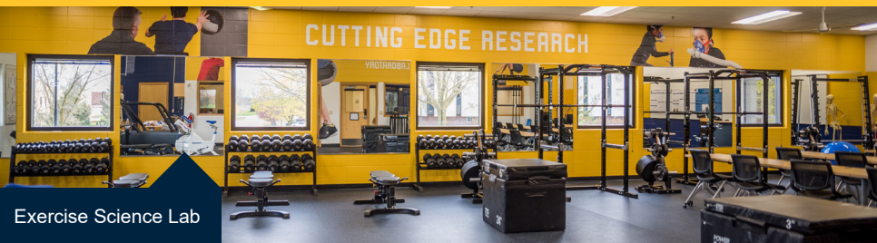
Exercise Science Lab