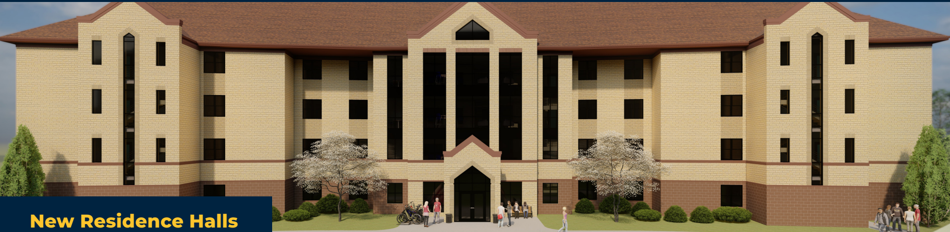
New Residence Halls

Lakeland's two new residence halls , which opened fall 2022, serve freshman and sophomores. These two new halls provide Lakeland with 396 beds. This is Lakeland's largest single investment in the main campus in our 160-year history.