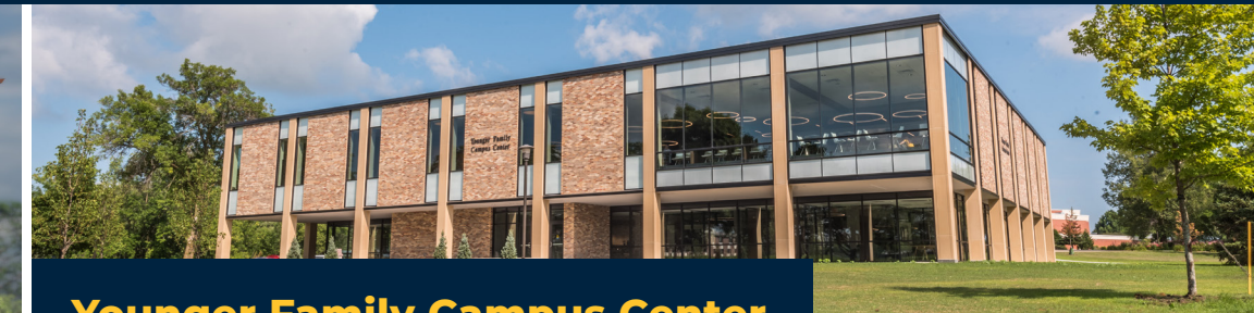
Younger Family Campus Center

The heart of your campus. The newly renovated campus center was designed with YOU in mind!