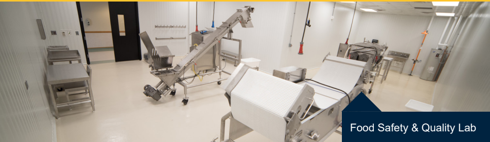
Food Safety & Quality Lab

Lakeland is constantly investing in campus classrooms and lab spaces to provide students with modern, high-quality places to learn. Thanks to the generosity of donors and corporate partners, Lakeland labs often replicate what students will find in the workplace following graduation.