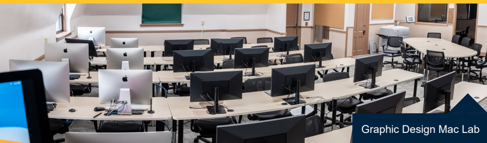
Graphic Design Mac Lab