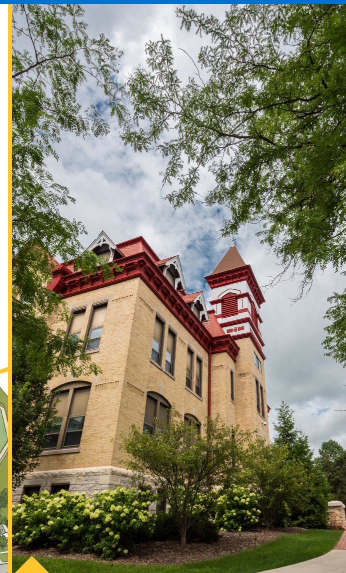
Old Main opened in 1888 and is one of our primary classroom buildings.