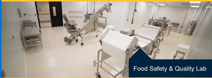
Food Safety & Quality Lab