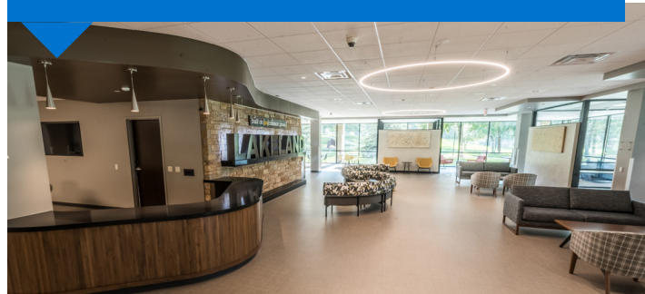
Younger Family Campus Center

Lakeland is constantly investing in campus classrooms and lab spaces to provide students with modern, high-quality places to learn. Thanks to the generosity of donors and corporate partners, Lakeland labs often replicate what students will find in the workplace following graduation.