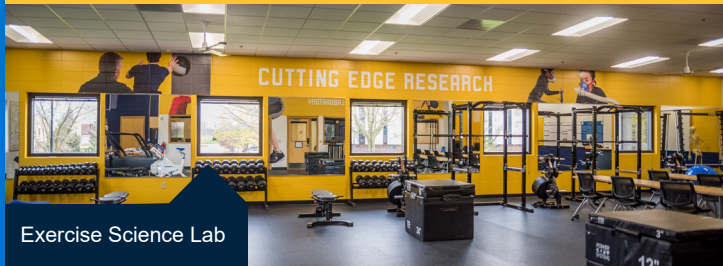
Exercise Science Lab