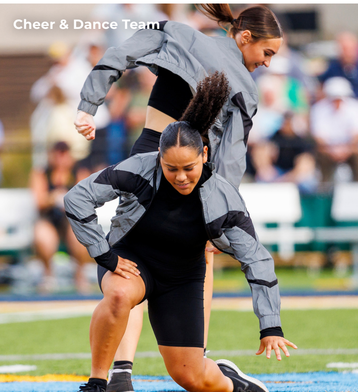
Cheer & Dance Team