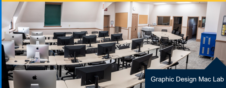
Graphic Design Mac Lab