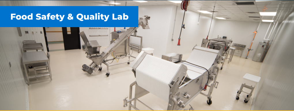
Food Safety & Quality Lab

Lakeland is constantly investing in campus classrooms and lab spaces to provide students with modern, high-quality places to learn. Thanks to the generosity of donors and corporate partners, Lakeland labs often replicate what students will find in the workplace following graduation.