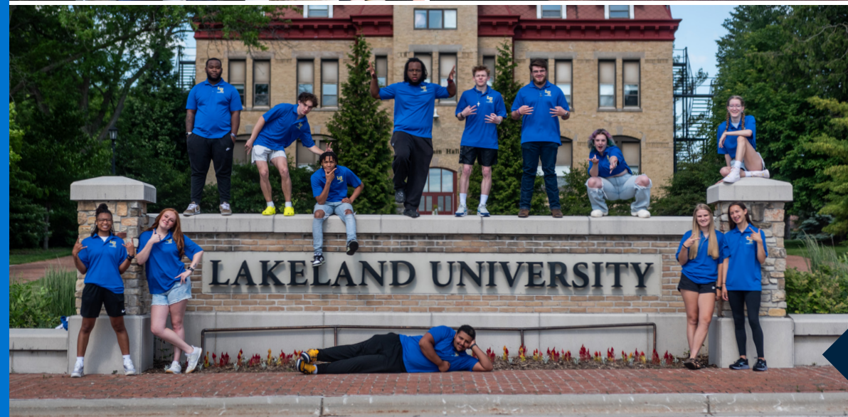
Blue & Gold Champions